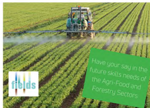
Figure 2. Images for use on social media and web-based platforms for promoting the survey